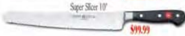
Super Slicer 10"